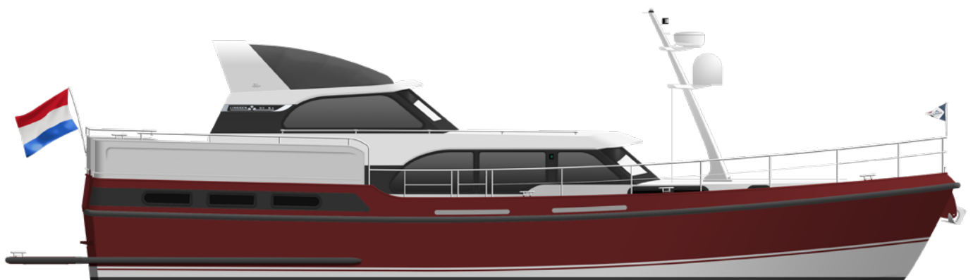
Artists Impression Linssen 50 SL AC Variotop®75 Edition