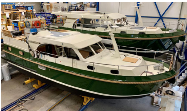
Grand Sturdy 35.0 AC & Sedan in Velvet Green