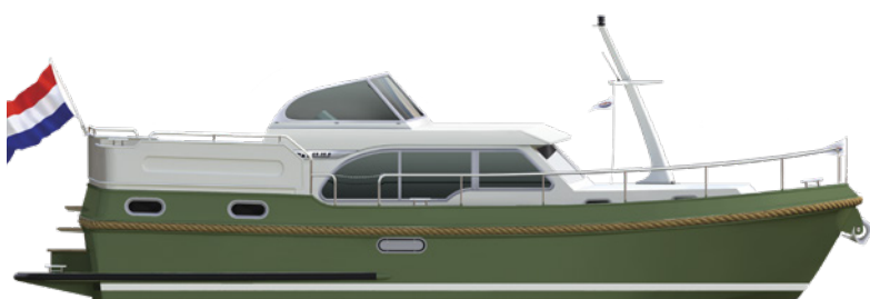
Artists Impression Grand Sturdy 35.0 AC 75 Edition