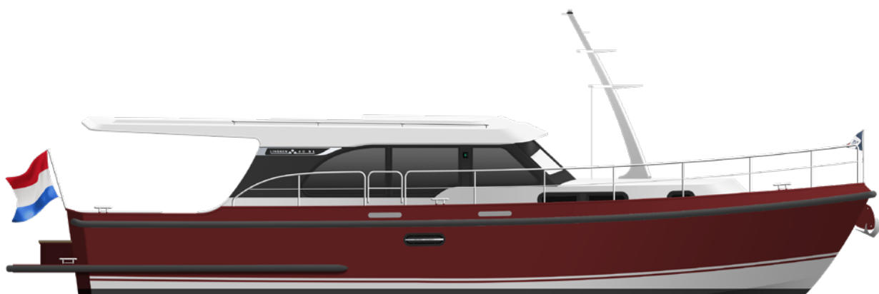
Artists Impression Linssen 40 SL Sedan 75 Edition